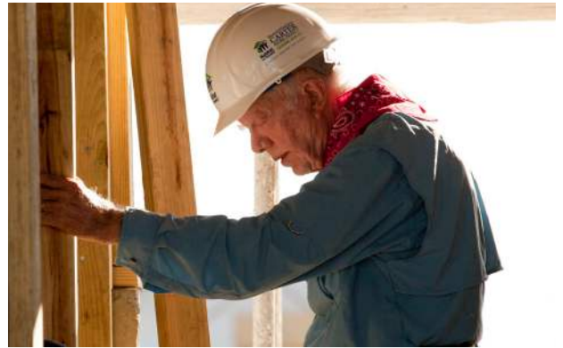
President, Jimmy Carter volunteering in Leogane, Haiti in 2011.

Like so many others, I first learned of Habitat for Humanity when I saw President Carter and his wife Rosalynn with their helmets on and hammers in hand, serving as volunteer builders. The pair demonstrated their commitment to Habitat’s mission through action – continuing to volunteer on build sites well into their nineties. With the latest news that President Carter has entered hospice care at his home in Georgia, many are reflecting on his achievements throughout a long life spent dedicated to public service and volunteerism. He was instrumental in efforts to protect our environment, secure equity for the poor, the middle-class, for women and people of color, and to improve the health and quality of life for all people around the world.